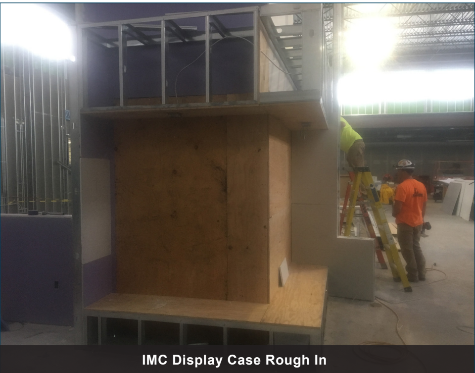
IMC Display Case Rough In