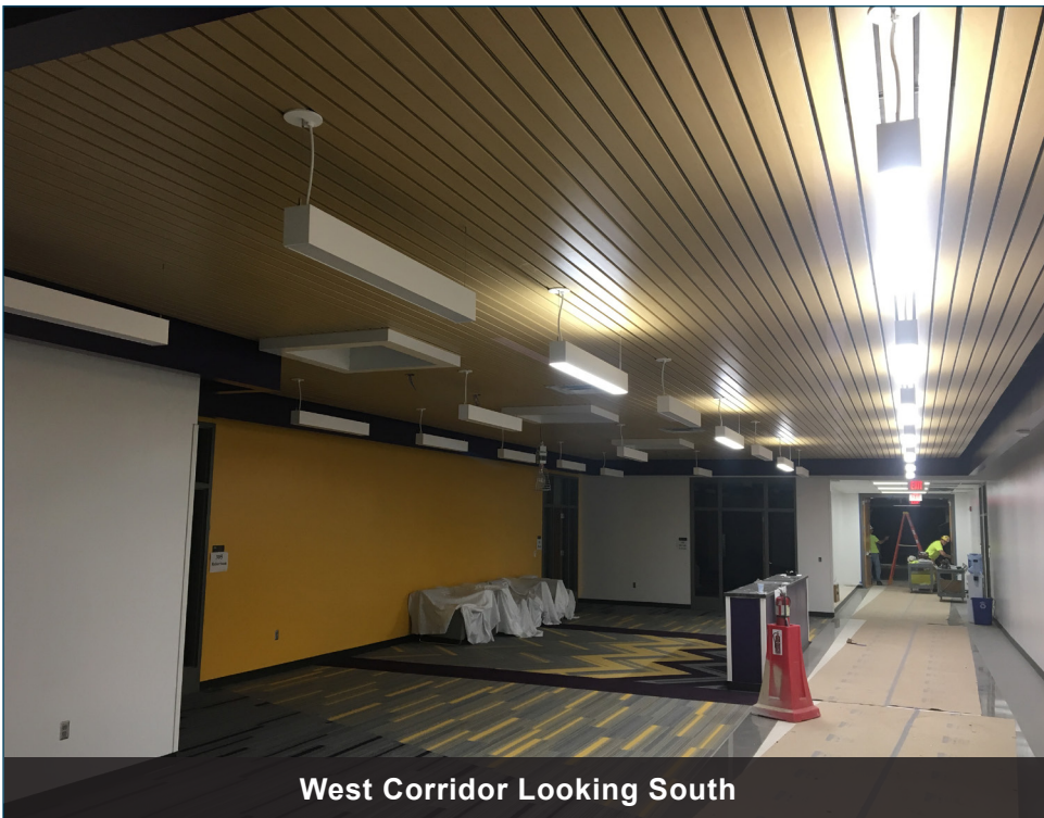
West Corridor Looking South