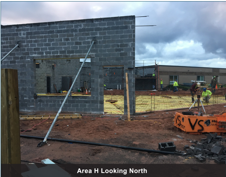
Area H Looking North