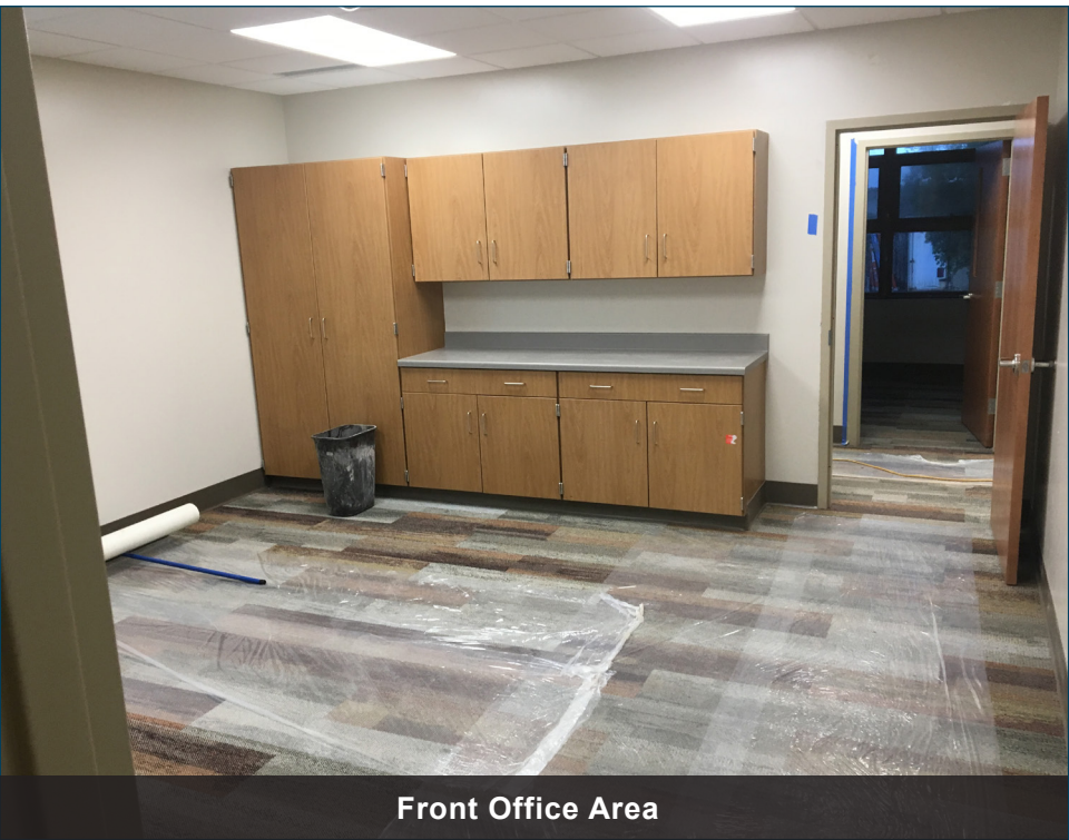
Front Office Area

Phase I and IA Complete..... August 15, 2017 Phase 2 Complete..... November 15, 2017