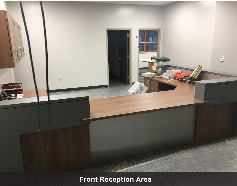
Front Reception Area