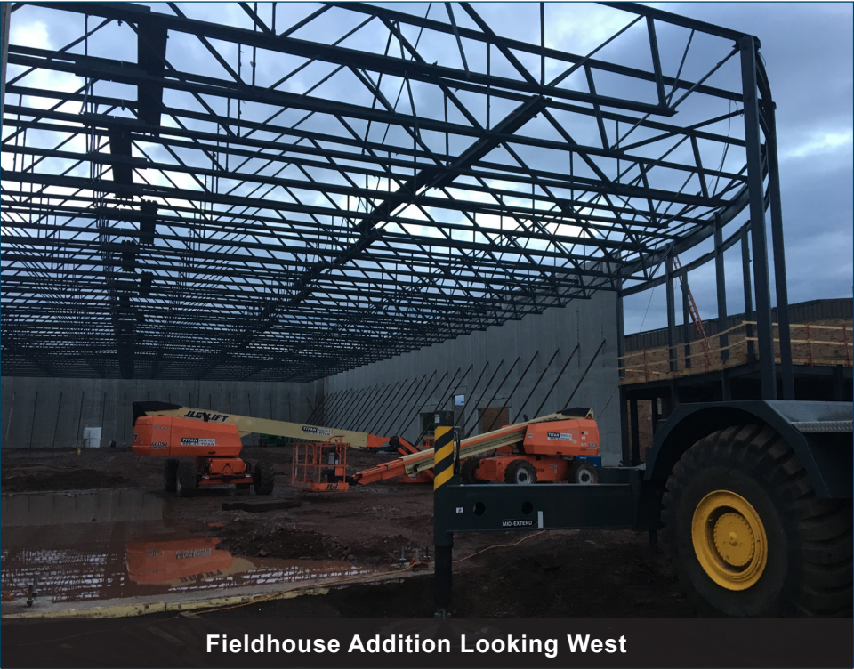
Fieldhouse Addition Looking West