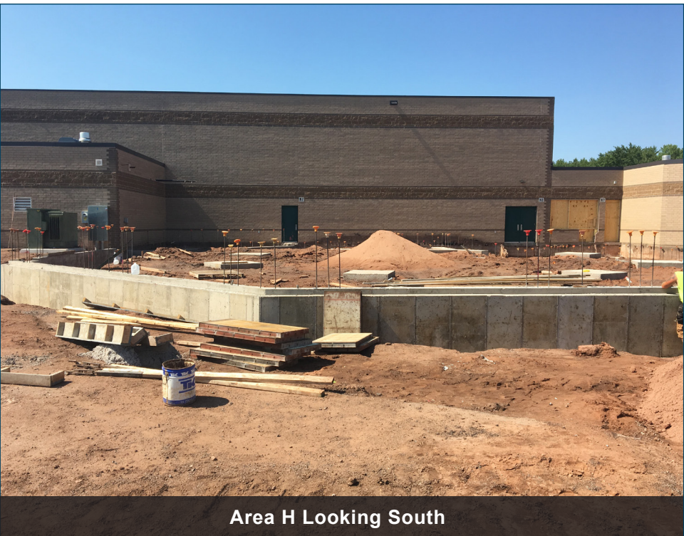
Area H Looking South

Phase I and IA Complete..... August 15, 2017 Phase II Complete..... November 15, 2017