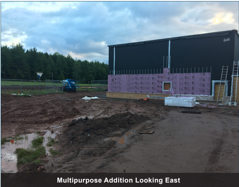
Multipurpose Addition Looking East