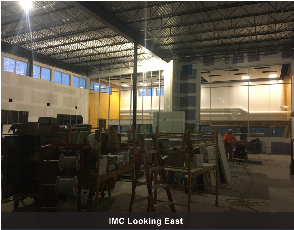
IMC Looking East